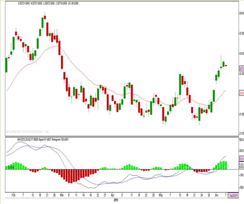
MCX GOLD AUG – CMP 32710